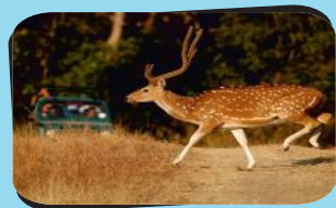
Pench - 209 km.