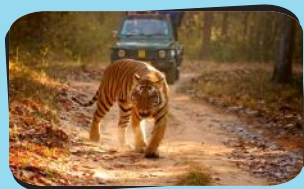
Kanha - 165 km.